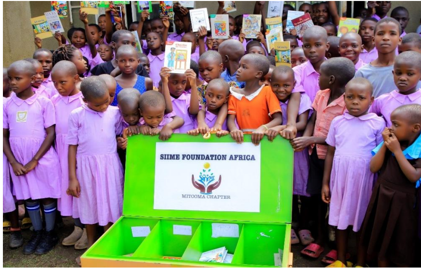
Primary school children displaying books borrowed from the library in a box

were reached with this initiative. New schools have expressed interest in joining the program; however, additional funding is required for the organization to expand coverage and meet the growing demand.