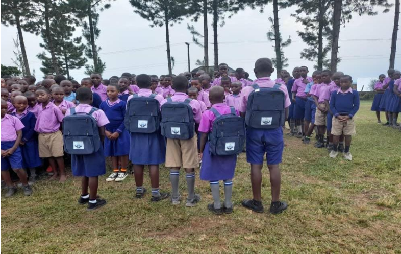
Some of the scholarship awardees displaying their school bags.

Cemelia Initiatives Africa implements a merit-based scholarship for vulnerable academic gifted students. The scholarships cover tuition, PTA and/or scholastic materials. In collaboration with Siime Foundation Africa, the organization provided scholarships to 5 children in Rwagashani primary school. In addition, 5 other scholarships were provided to secondary school students in Gulu and Ntungamo districts. The scholarship awardees performed well and progressed to the next level of their education.