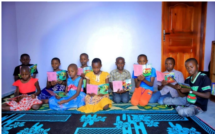
Some of the children participating in the sit and read program

Cemelia Initiatives Africa also implements the “Sit and Read” library initiative which aims to improve literacy skills through providing an environment for reading every Sunday afternoon. This program targets children in Katenga township and the surrounding villages. The initiative reached over 340 children by the end of 2024.