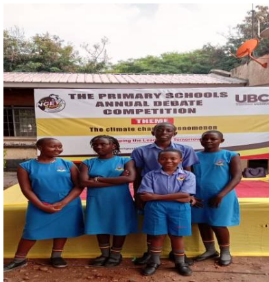
Mothercare pupils delivering environmental justice messages through drama and debates