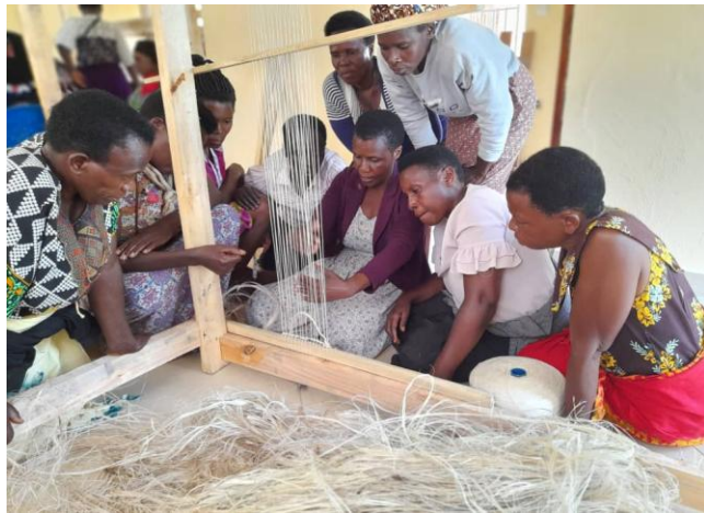
Trainees learn how to use a weaving board

During the reporting period, women, and youths were mobilized and introduced to the value addition to the banana crop. Thirty-two participants were trained in banana fibre extraction, using weaving boards to produce eco friendly crafts in November 2024.