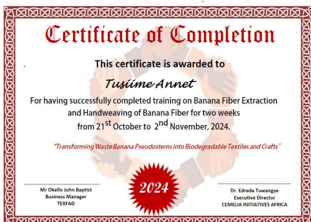
Sample Certificate awarded to the trainees

The 32 trainees were awarded training completion certificates. This function was covered by Voice of Ruhinda and aired to inform a wider audience. Following the training, the trained beneficiaries continued accessing the common user facility, at their convenient time, to advance their skills and make products for sale.