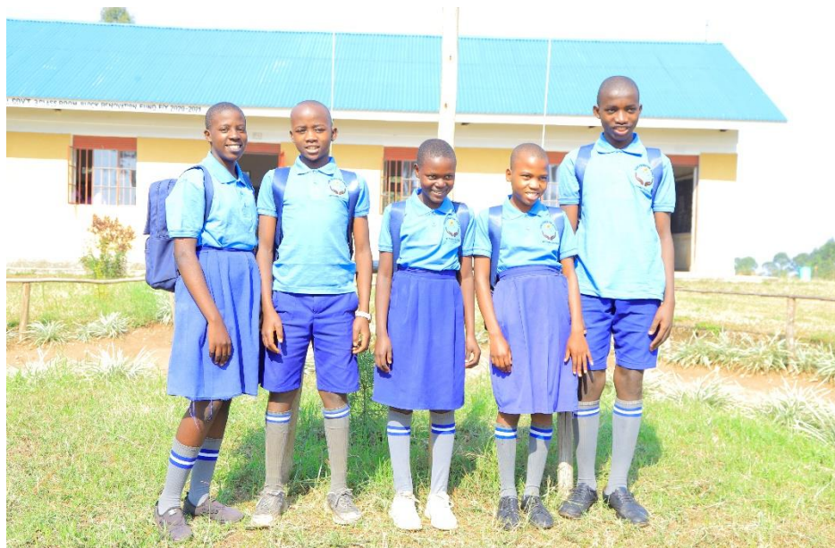
Some of the scholarship awardees displaying their school bags.

Cemelia Initiatives Africa implements a merit-based scholarship for vulnerable academic gifted students. The scholarships cover tuition, PTA and/or scholastic materials. In collaboration with Siime Foundation Africa, the organization provided scholarships to 7 pupils in Rwagashani primary school. In addition, 2 other scholarships were provided to former scholarship awardees at Rwagashani Primary School; a boy and a girl who performed well and progressed to the next level of their education. They are now at Ruhinda Secondary School and St. Kaana International School respectively.