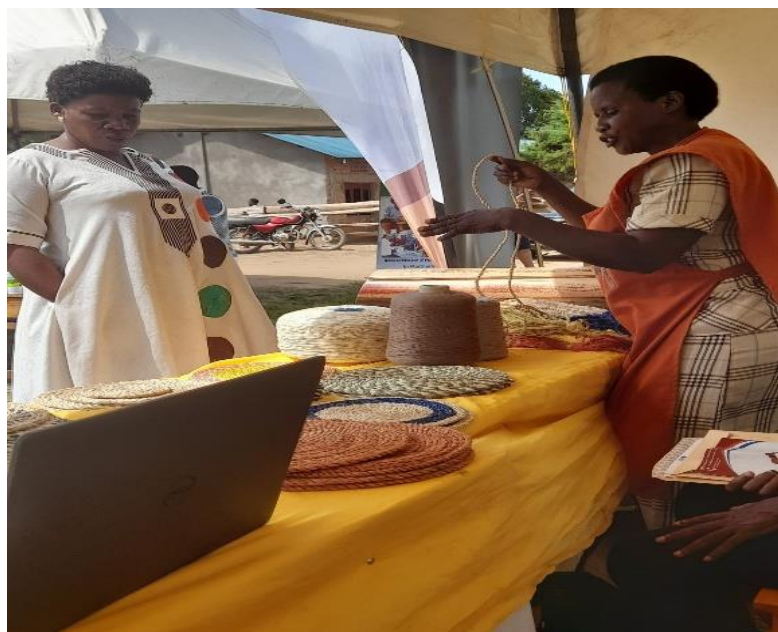
Show casing Bana-craft products during the District Women’s Day Celebrations