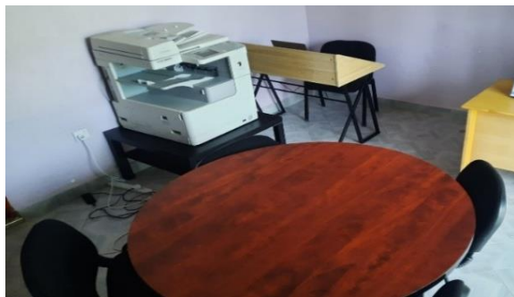
Some furniture and equipment in the Katenga Office

During the reporting period, the offices in Katenga Trading Centre were refurbished with more executive furniture; Chairs, Tables, Filing Cabinets and other office equipment like; a projector, Photocopier, Fridge and a Projector screen.