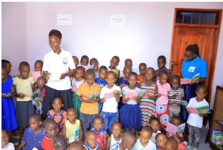
Some of the children participating in the sit and read program

Cemelia Initiatives Africa implemented the “Sit and Read” library initiative aiming at improving literacy skills through providing an environment for reading every Sunday afternoon. This program targeted children in Katenga township and the surrounding villages. During the reporting period, the numbers reached decreased to an average of 20 pupils per Sunday.