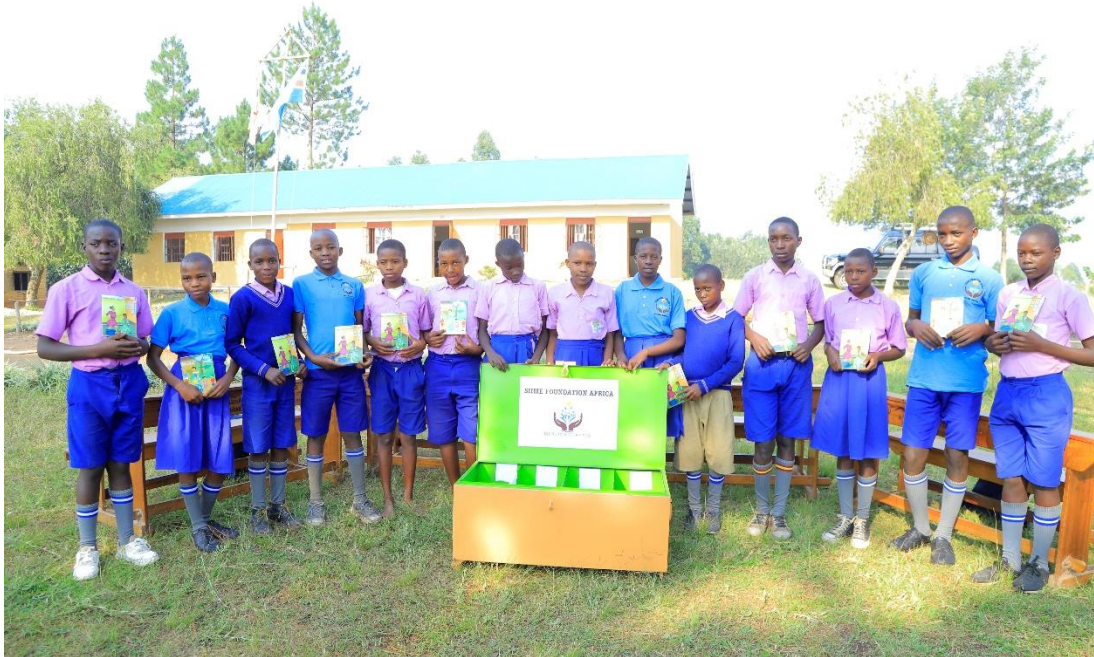
Primary school children displaying books borrowed from the library in a box