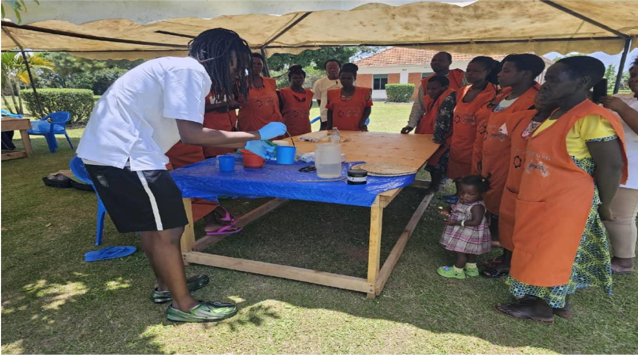
Weavers being trained on how to dye fibre

This objective was implemented under the BanaCloth Project whose goal is to skill women and youths to transform banana pseudo stem into quality, and biodegradable crafts for both the local and international markets.